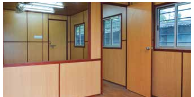
Manager cabin with internal partition